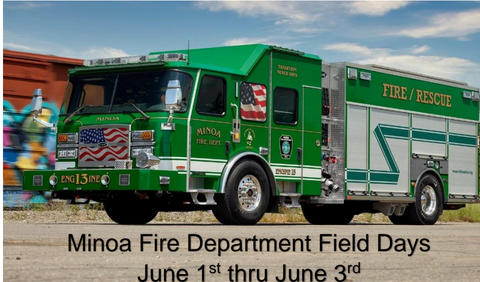
Minoa Fire Department Field Days June 1 st thru June 3 rd