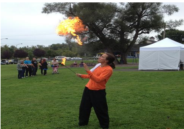
Flame thrower performs during the First Annual Festival in the Park.