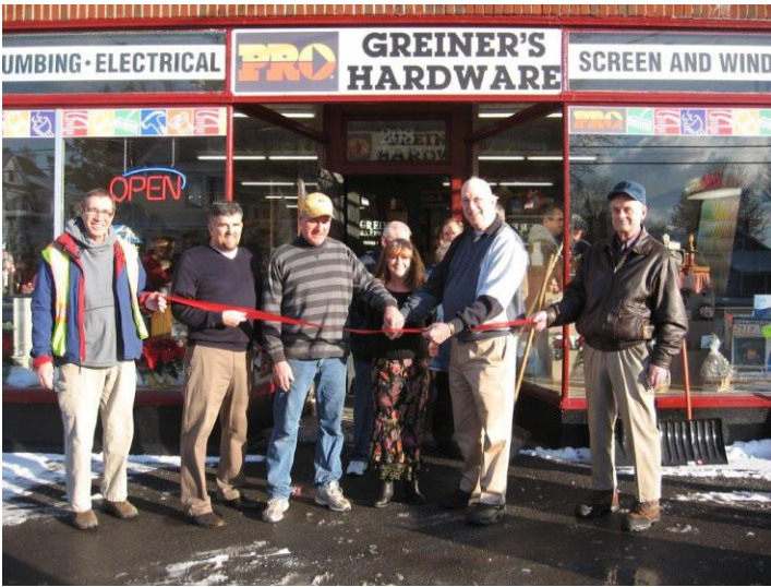
Ribbon Cutting Ceremony for the Opening of Greiner's Hardware.