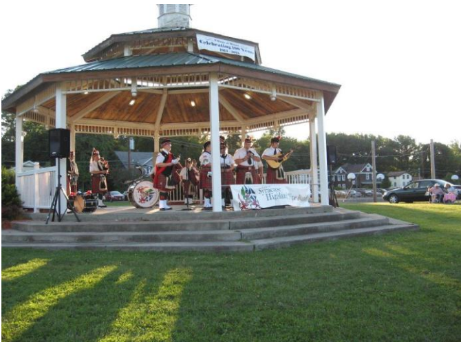
City of Syracuse Highland Pipe Band Performing this summer at Lewis Park.