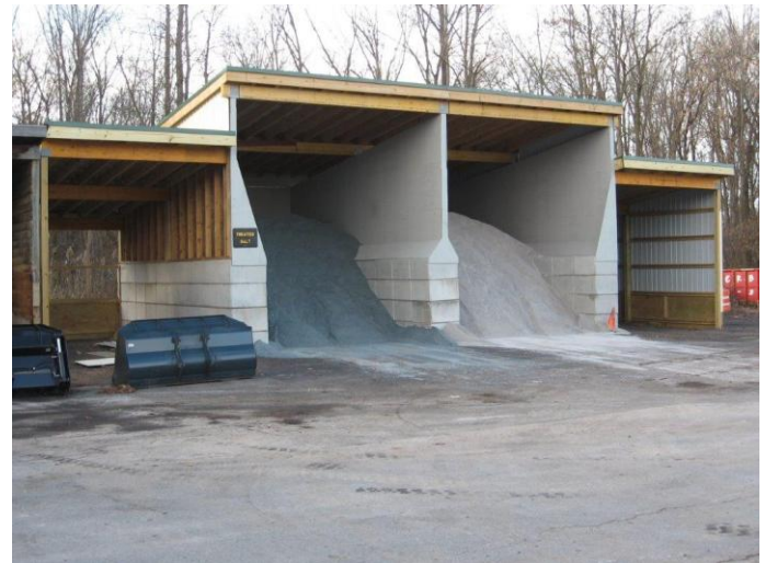
Our new Salt Shed was completed this year by the Minoa DPW. Saving the Village of Minoa over $100,000 compared to commercial structures.