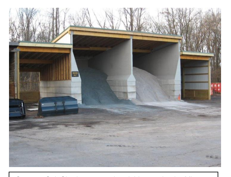
Our new Salt Shed was completed this year by the Minoa DPW. Saving the Village of Minoa over $100,000 compared to commercial structures.