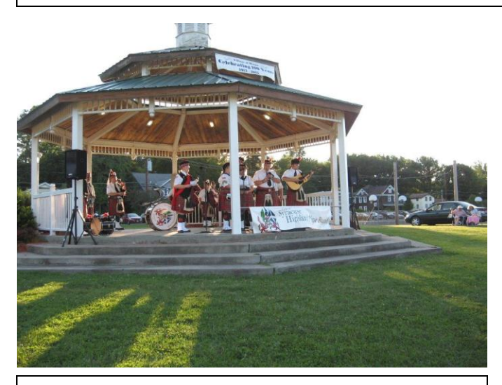
City of Syracuse Highland Pipe Band Performing this summer at Lewis Park.