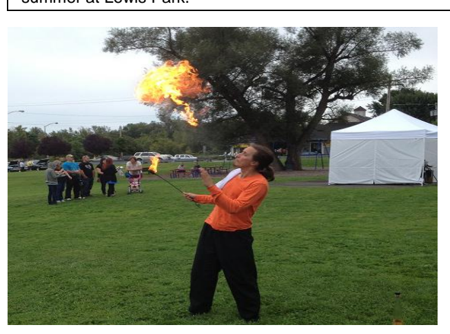
Flame thrower performs during the First Annual Festival in the Park.