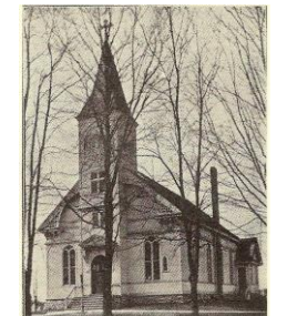
St. Mary's Church