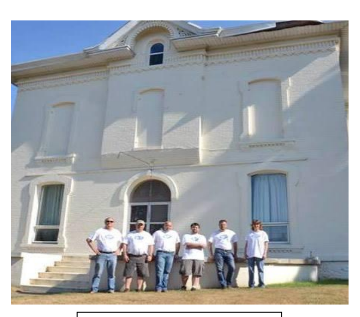
The Oneida Air Systems Team