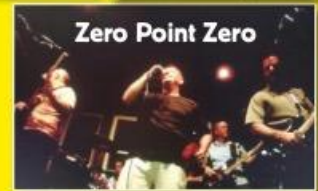
Zero Point Zero